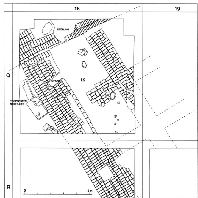
Figure 3: Plan of Workshop W1.

Sometime after Thutmose III came to the throne, which corresponds to the outset of Phase C/3 (= Stratum d) and probably a time early in his coregency with Hatshepsut, 20 construction at the palatial district exploded to proportions never seen before at Avaris, which corresponds well with his post-coregency foreign conquests and amassing of wealth. 21 Palaces F and G were built in parallel, 22 separated by a massive rectangular lake, although Palace G was considerably larger in size (see Figure 2). A third palace (J) was built immediately to the southwest of Palace G, 23 but during the subsequent Phase C/2 (= Stratum c), Palace J was dismantled and gave way to a large workshop (W2) with administrative offices and magazines. Other workshops were constructed in the palatial district during Phase C/2, with pumice having been found in all of them, 24 which through chemical analysis was found to have derived from the Thera/Santorini volcanic eruption of the middle of the 2 nd Millennium BC. 25 In workshop W1 (Figure 3), Bietak's team found two lumps of arrowheads with a total of over 140 Aegean arrow-tips of bronze, which demonstrates that the workshops were used for the production of weapons for military purposes and explains the presence of the large quantity of pumice, 26 which in antiquity was used as an abrasive to polish items made of bronze.